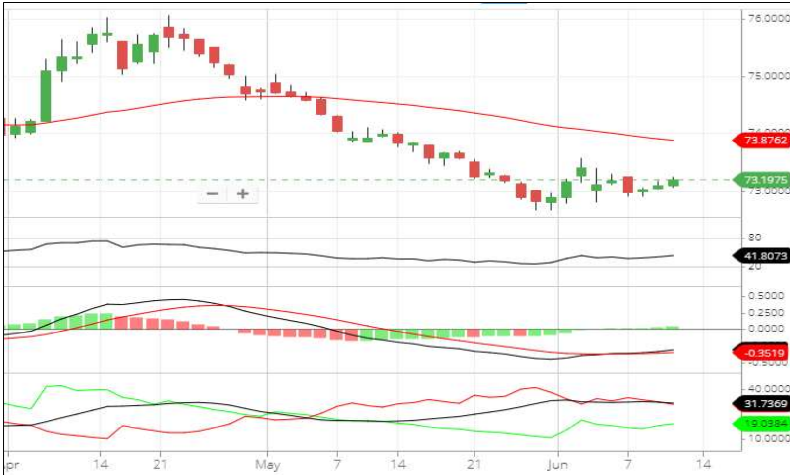
USDINR June Daily Chart